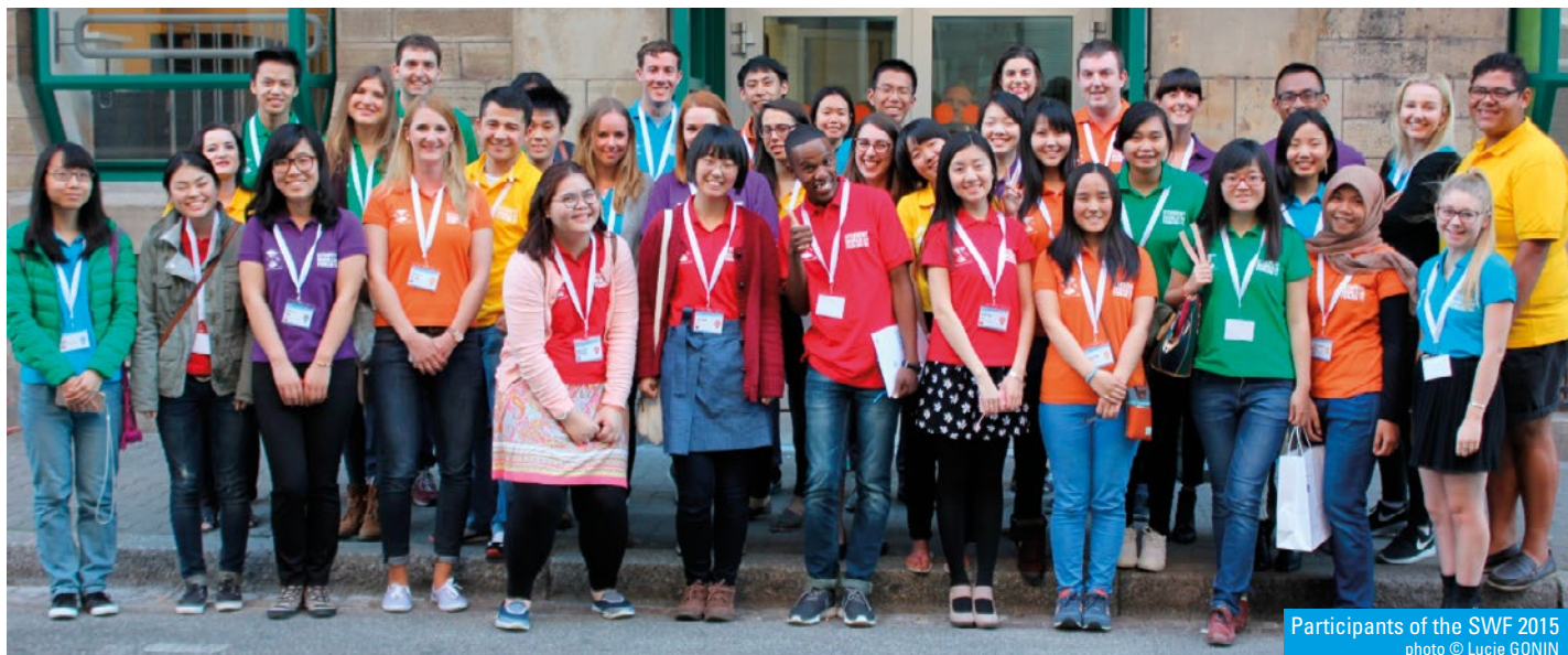
Participants of the SWF 2015

Afterwards, all participants gathered in front of the CIARUS youth hostel to take a colorful picture.