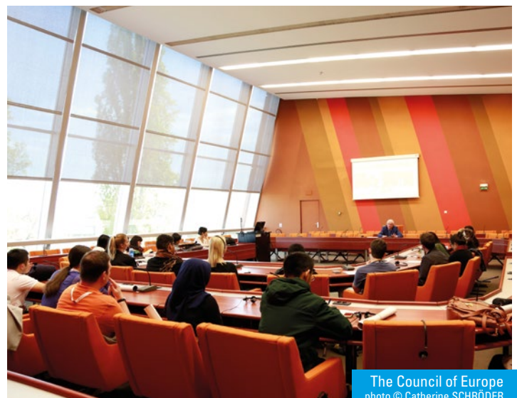
The Council of Europe photo © Catherine SCHRÖDER