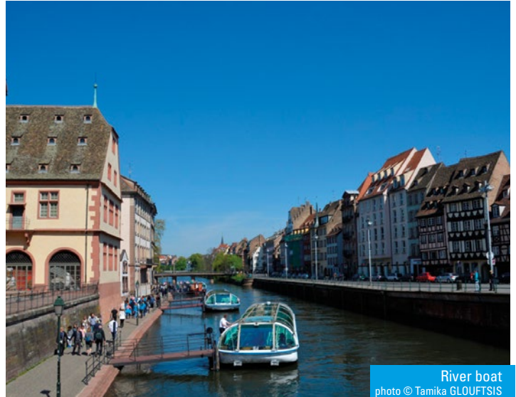
River boat photo © Tamika GLOUFTSIS

On that evening, a very traditional Alsatian dish was on the menu: the flâmmeküeche .