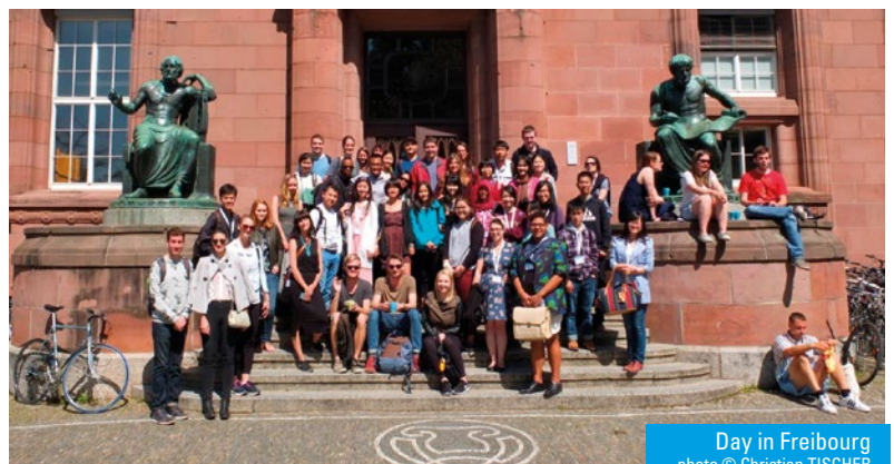
Day in Freiburg