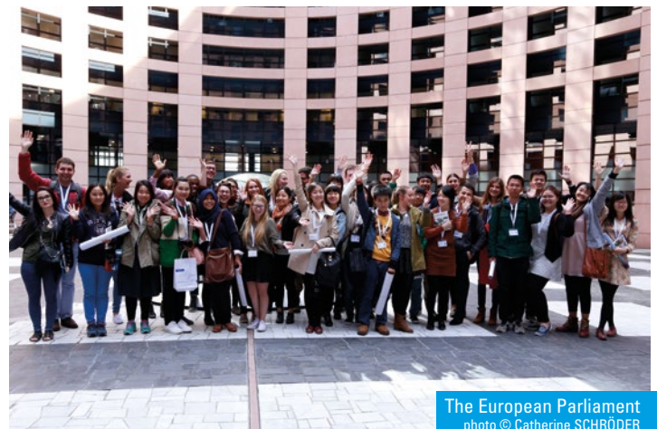
The European Parliament