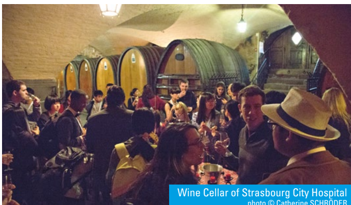
Wine Cellar of Strasbourg City Hospital

After the wine-tasting session, the day ended on a cheery note in the Cerf d’Or restaurant. Since 1917, this lovely restaurant has been offering traditional and tasty Alsatian food. On this evening, the students discovered the sauerkraut with zander and really enjoyed it.