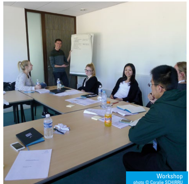
Workshop photo © Coralie SCHIRRU