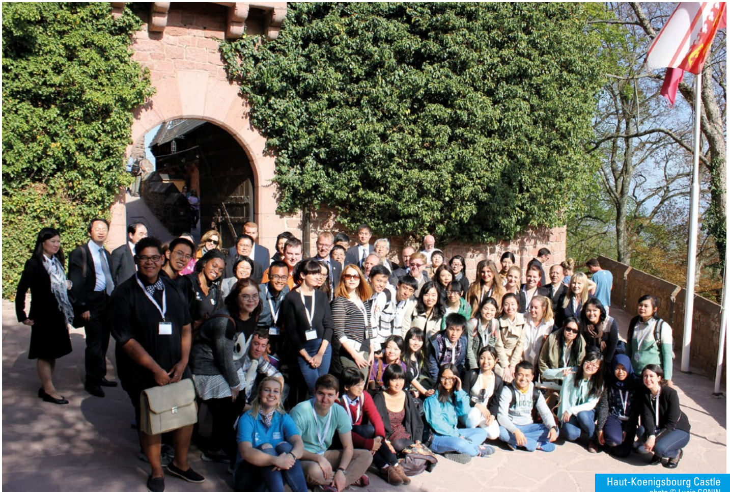
Haut-Koenigsbourg Castle