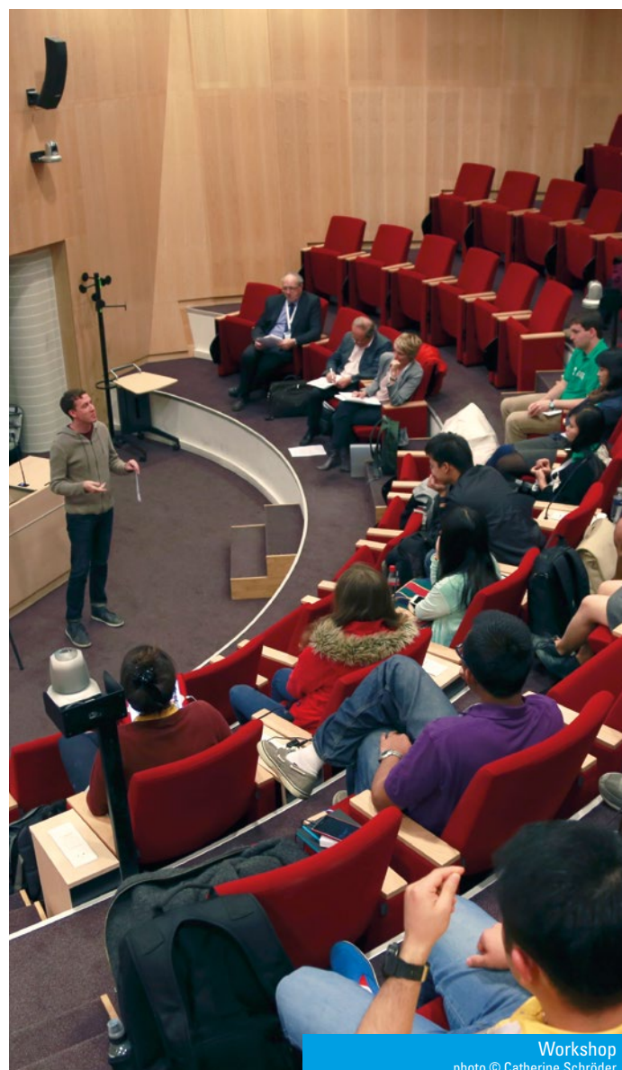
Workshop

Each team had to think about these questions for their department and they all managed really well to find the answers. Again, the students were much implicated in this simulation game and showed that they were really interested in what they had learned during the day.