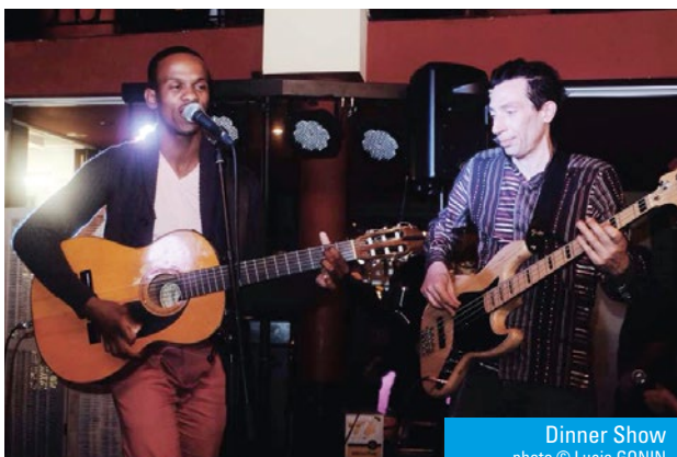
Dinner Show photo © Lucie GONIN