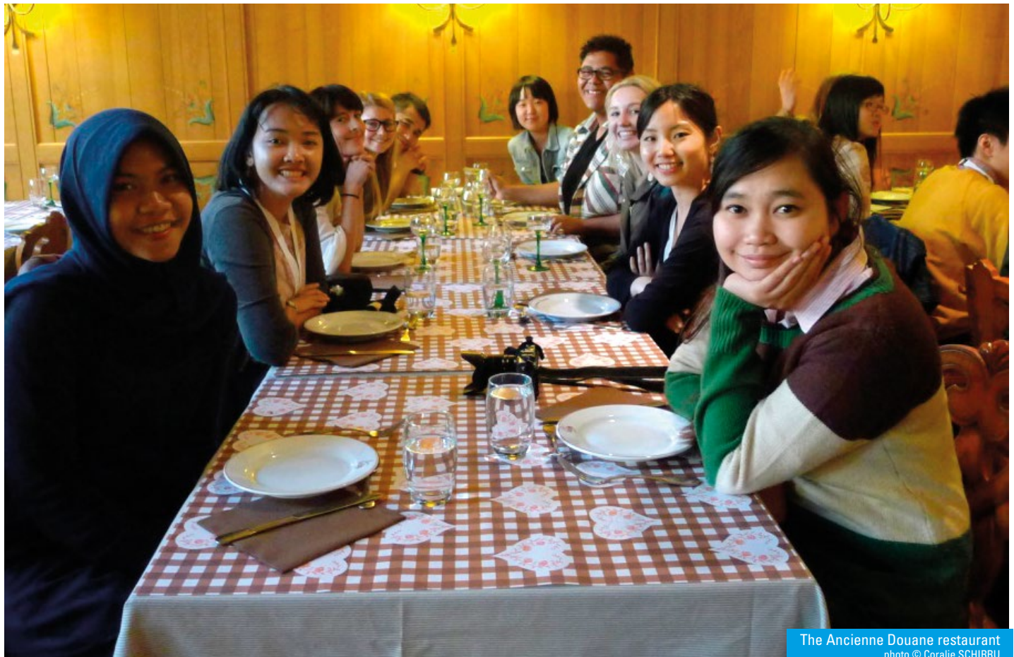
The Ancienne Douane restaurant

“ To me, the Student World Forum was about learning the local and regional democracy in Europe through lectures, workshops, visits to European Institutions and staying in the beautiful city of Strasbourg. It was also a great chance to make lifelong friends from all over the world and experience the local culture and traditions in the central city of Europe.”