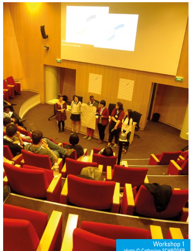
Workshop 1