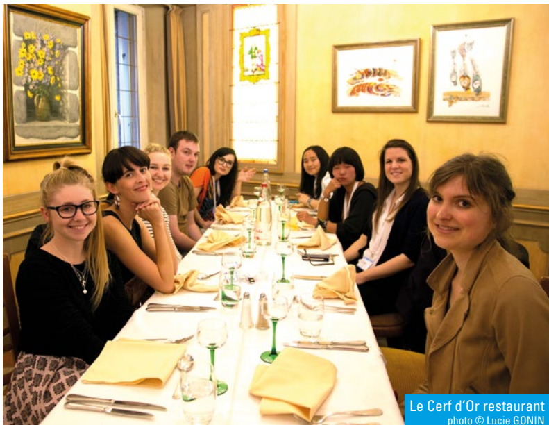
Le Cerf d'Or restaurant