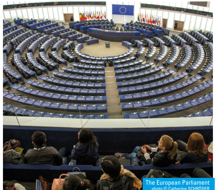
The European Parliament photo © Catherine SCHRÖDER

The Council of Europe promotes human rights through international conventions, such as the Convention on Preventing and Combating Violence against Women and Domestic Violence and the Convention on Cybercrime. It monitors member states' progress in these areas and makes recommendations through independent expert monitoring bodies. Council of Europe member states no longer apply the death penalty 3 . ●●●