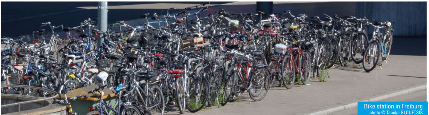
Bike station in Freiburg

The comments of the students show their great enthusiasm about the Student World Forum 15 .