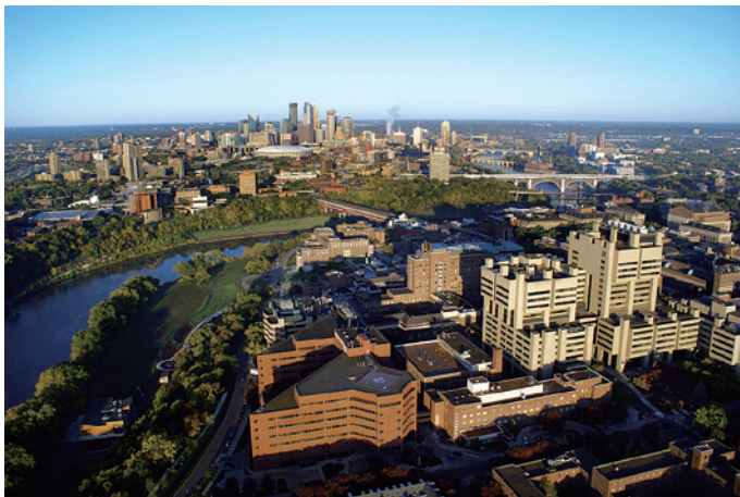
The University of Minnesota, Twin Cities campus is located on the banks of the Mississippi River near the downtown core of the city of Minneapolis.

the banks of the Mississippi River at the heart of one of the nation's most vibrant, diverse metropolitan communities. With a population of 2.8 million, the Twin Cities are the 16th largest metropolitan area in the U.S. Minnesota is home to the world-renowned Mayo Clinic and the headquarters of 21 Fortune 500 companies, including 3M, Medtronic, and Cargill. Faculty and students benefit from extensive partnerships with world-renowned health centers; international corporations; government agencies; and arts, nonprofit, and public service organizations.