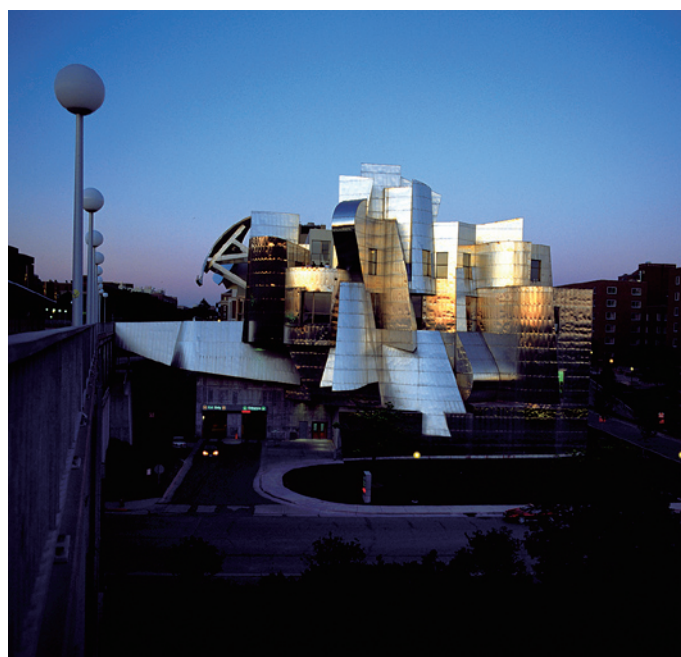
The University's art collection is housed in the Weisman Art Museum, a modern building that was designed by internationally renowned architect Frank Gehry.