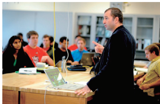
University Communications at NC State

How? Researchers across the university and Centennial Campus are deeply engaged in making new, application-driven discoveries. As a major research university, NC State has the people – from undergraduate and graduate students to faculty – and the responsibility to advance knowledge, transfer technology, and discover and develop innovations that solve some of the world's