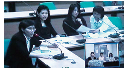
Video conference system projecting film of Chulalongkorn University side and Nagoya University side [inner screen]

When you attend preliminary meetings for the Summer School, you will notice loyal