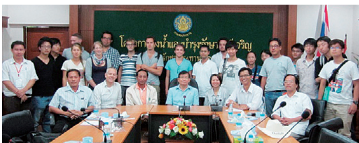
Group photo after the lecture