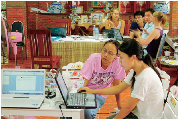
Group work at the homestay

With this, an intense but rewarding training program had come to a close. The farewell dinner in Bangkok of course still carried weight, but the work had largely been done. Learning had been achieved for the 18 student participants, for the Krathum Baen community, and for the supervising faculty alike.