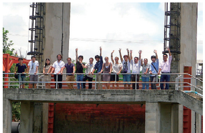
At the watergate