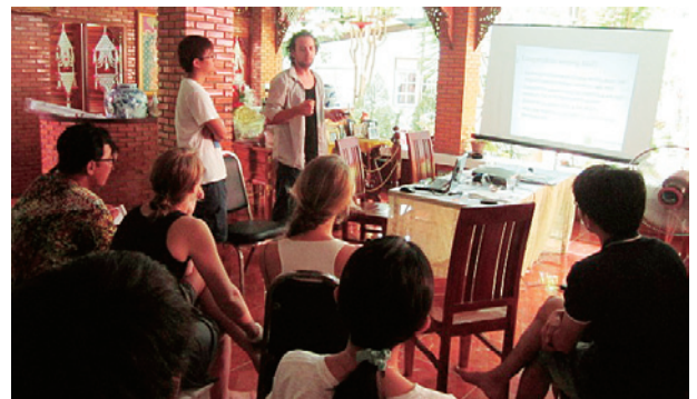
Preparation for the Seminar at homestay