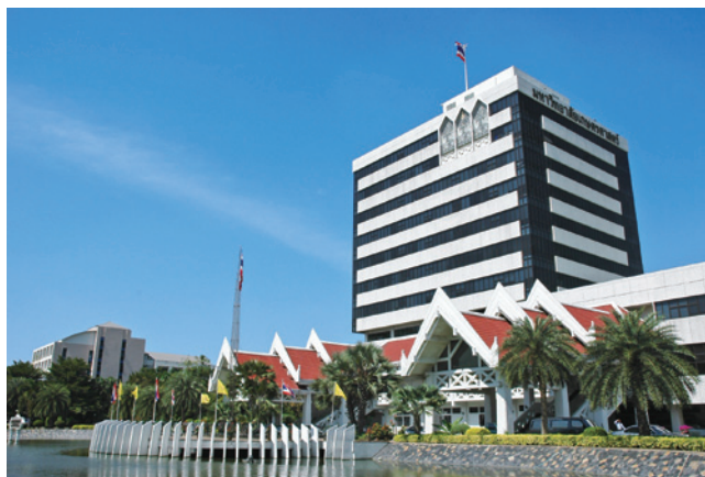
Kasetsart University Campus

Kasetsart University welcomes all University partners and student participants of the AC21 International Graduate Summer School. We are proud to co-host this main AC21 activity together with Chulalongkorn University and Nagoya University. We hope that this Graduate Summer School will help to increase the participants' understanding of the importance of Agricultural Science in food and nutrition securities, to raise awareness among participants of the particular value and the contribution of Agriculture Education, and to motivate them to learn to collaborate effectively in their future careers.