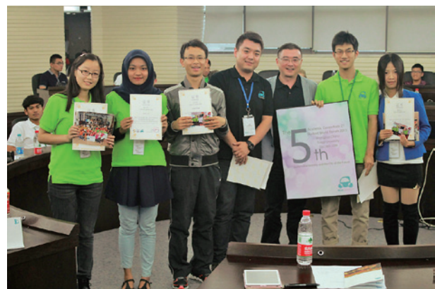
My team in the final presentation