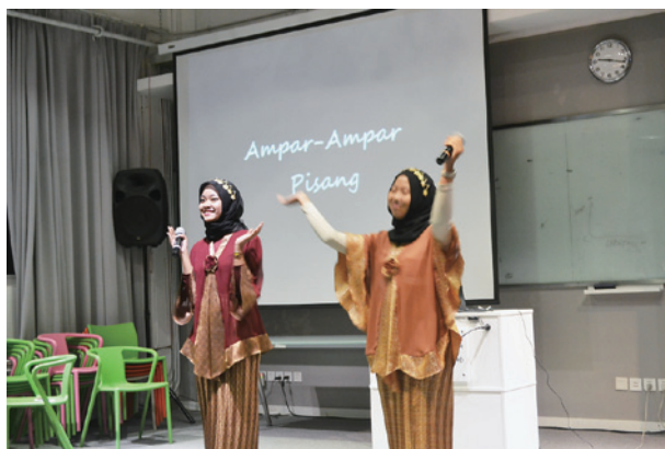
Indonesian cultural show

The final impression came on one fine day, two months after the Forum ended, when I received a postcard sent from the host of the Forum, Tongji University, Shanghai. Thank you AC21! Thank you Tongji University! That was just a perfect finale; you are the best committee I ever knew!