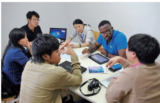
(Author, second from right)