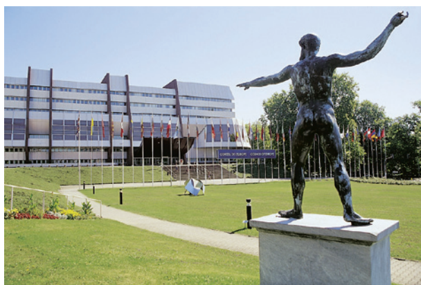
Council of Europe, Strasbourg

The University of Freiburg, also a member of AC21, as well as one of the major Eucor partners of the University of Strasbourg, has agreed to become involved alongside us in the Student World Forum. As part of this event, one entire day will be hosted in Freiburg. We are delighted with this cooperation and honoured to host the two AC21 key events that are the Student World Forum and the Steering Committee Meeting.