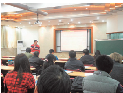
Opening Ceremony of the Forum