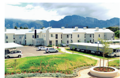
Ukwanda Rural Clinic