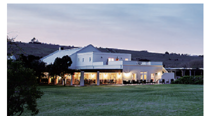
Spier Conference Centre