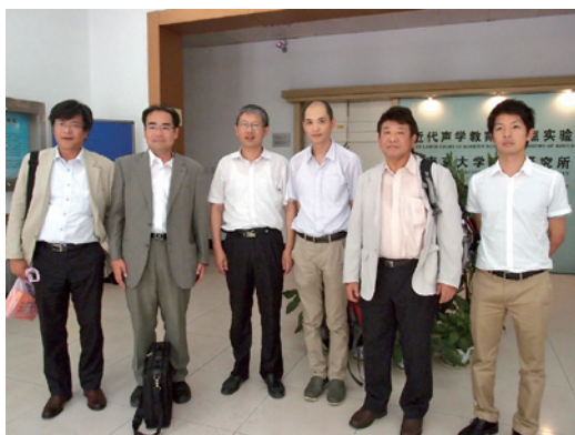
Members from the three universities visited the laboratory at Nanjing University and participated in seminars.

In conclusion, our team has largely finished the tasks for its AC21 project and reached the final goals. We have promoted understanding, cooperation and relationships between graduate students in the form of the inter-university visits, participating in seminars, and studying and having discussions together. On this basis, we can strengthen the cooperation in research and graduate education between our three universities. Additionally, this project should promote further understanding between the three universities and form a strong union of research in this field. Finally, we would like to give our special thanks to the AC21 Special Project Fund and Secretariat for their support.