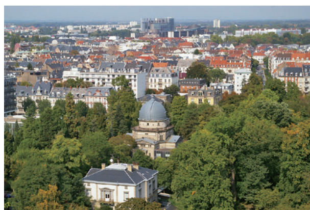
City of Strasbourg